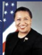
Ambassador Carol Moseley Braun

Omni Hotel Independence Park, www.omnihotels.com