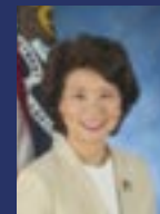
U.S. Secretary of Labor Elaine L. Chao