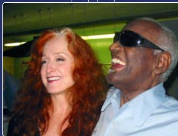
Ray Charles and Bonnie Raitt