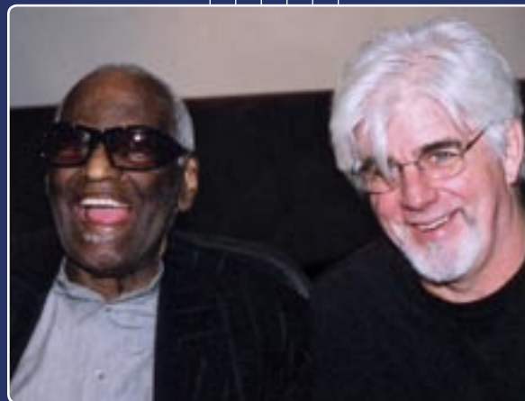
Ray Charles and Michael McDonald