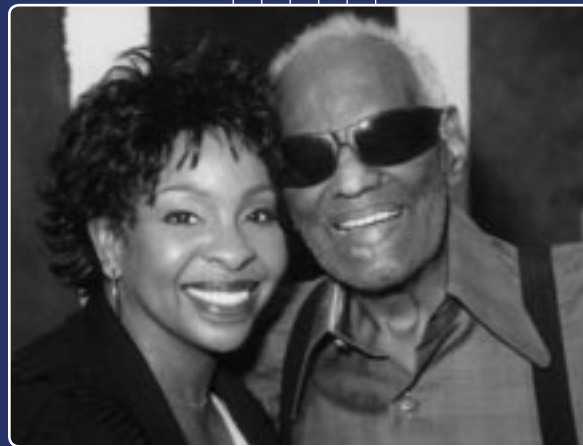
Ray Charles and Natalie Cole